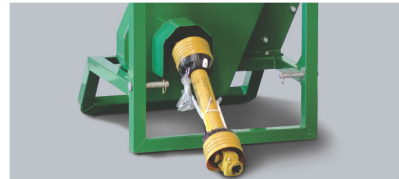
Tractor mounted PTO driven , suitable for any small tractor with 12 to 35HP. Connected to the three point linkage of your tractor. Designed for PTO speed of 540 rpm. Drive shaft is fitted with shear pin.