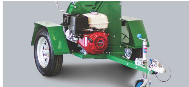
Road trailer version , complete with mud-guards, lights and coupling, for towing on highways. The ideal option for hire centres and contractors or if you have more than one property.