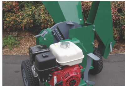
Easy access to knives and clearing of housing, a few turns of the wingnut and everything is accessible within seconds.